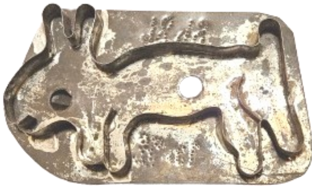
3 7 / 8 x 6 5 / 8 & dated 1898