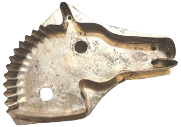
4 3 / 8 x 6