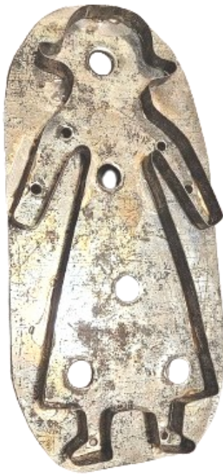
8 3 / 4 x 4 1 / 4