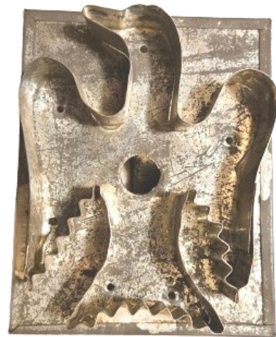
5 1 / 8 x 4 1 / 8