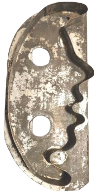
6 5 / 8 x 2 3 / 4 , Man In The Moon