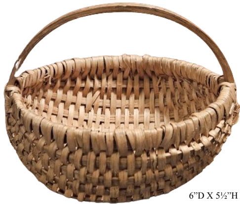
6"D X 5 1/2"H