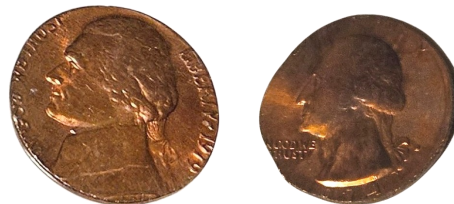
5¢ and 25¢ pieces struck on copper penny planchets.