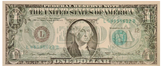
The back also overprinted on the front.