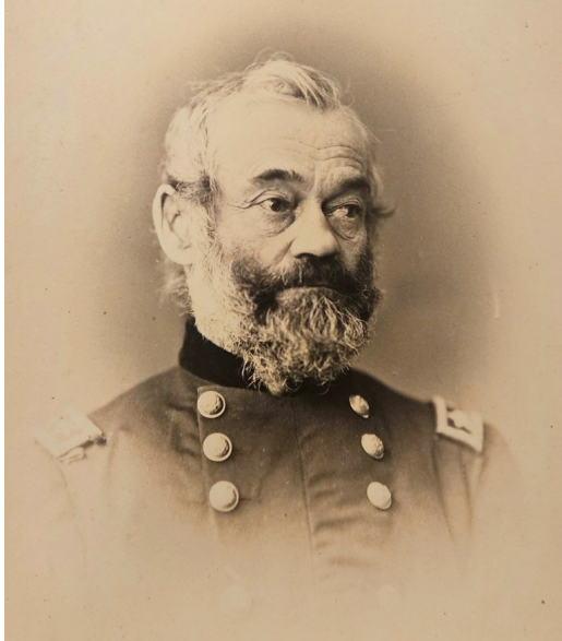
Maj. Gen'l Samuel P. Heintzelman