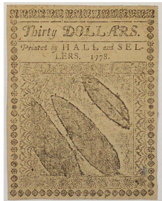
THREE WILLOW LEAVES

One important goal of HMPF is to continually try to publish little known and interesting historical facts concerning our early local, state and national history. We hope that our readers see the effort that is devoted to our publications and that they find them interesting and of value.